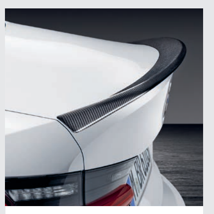
BMW M Performance Rear Spoiler in Carbon Fibre