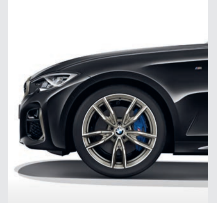
M Sport Brake