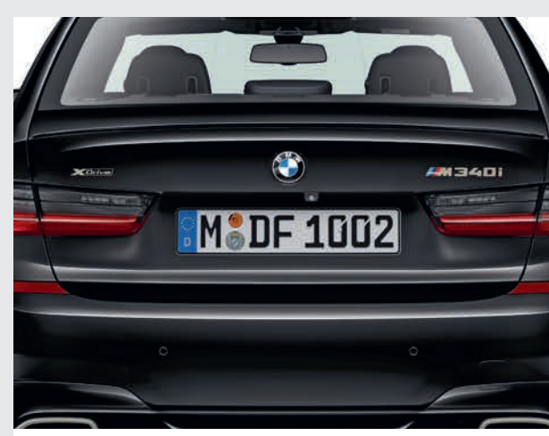
M Rear Spoiler in body color