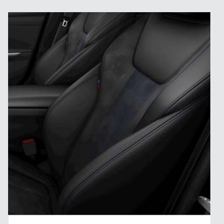
Alcantara Sensatec combination Black | contrast stitching Blue | Black

[ Colours ] The colours printed above are intended to provide you with a first impression of paints and materials available for your BMW. Experience has shown, however, that printed images of paint, upholstery and interior trim colours cannot faithfully reproduce the actual appearance of the originals. We recommend therefore that you consult your BMW partner who will be able to show you original samples and assist with special requests.