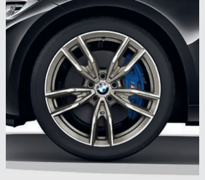
19" 792 M Light Alloy Wheels in Cerium Grey