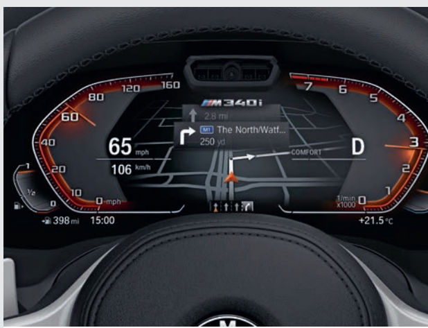
BMW Live Cockpit Professional with M340i specific display