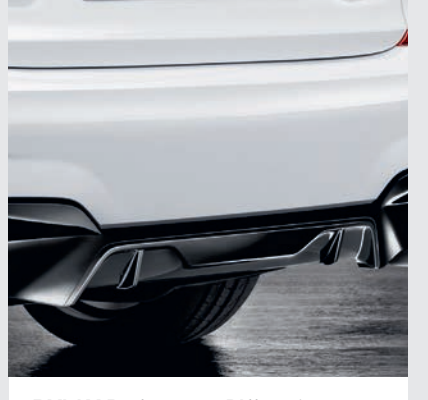
BMW M Performance Diffuser* in Carbon Fibre. Also available in Matt Black