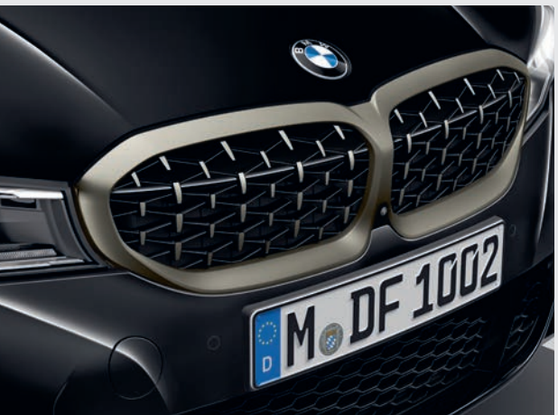
Cerium Grey Mesh Grille