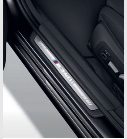
M Specific Door Sill