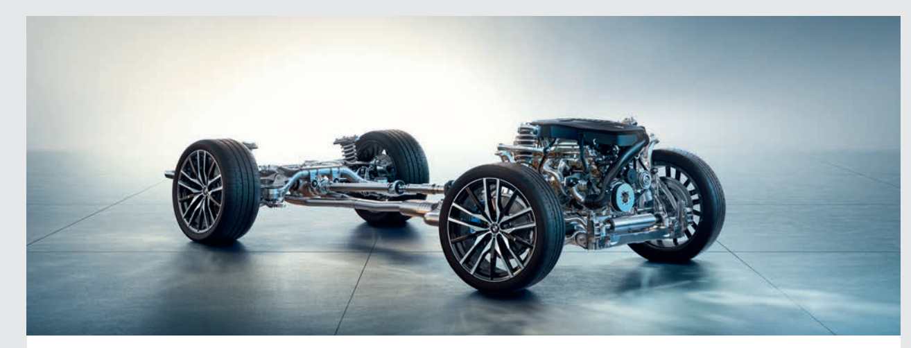
M Sport Suspension and xDrive - The intelligent All-Wheel Drive System