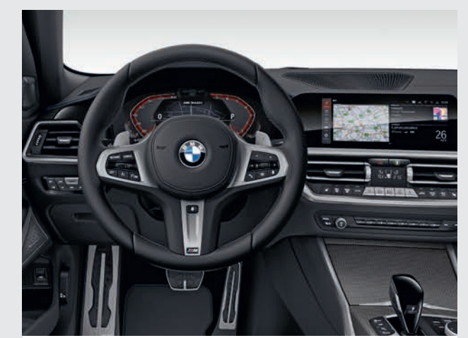
Variable Sport Steering