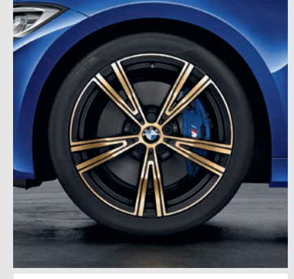
19" 793 M Light Alloy Wheels in Night Gold, Burnished

Terms and Conditions apply. The model, equipment and possible vehicle configurations illustrated in this advertisement may differ from the vehicles supplied in the Indian market. *Offer only vaild with buyback and is subject to change without any prior notice. *Only in conjuction with bumper trim.