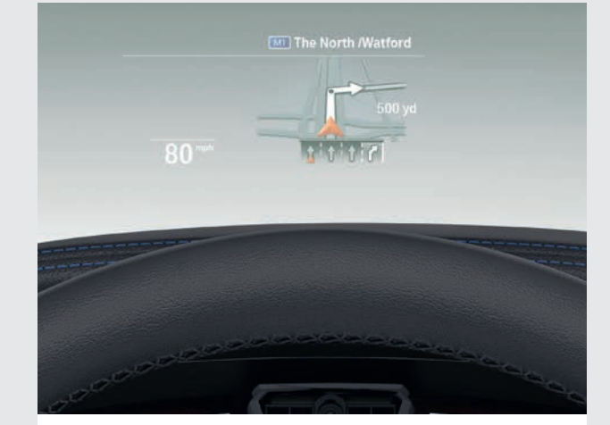
BMW Head Up Display<sup>1</sup>