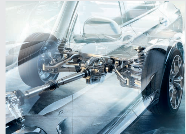
M Sport Differential