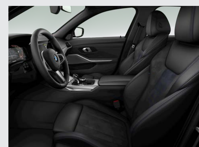
Sport Seats in Alacantara/Sensatec combination upholstery with M Seat Belts

<sup>1</sup>The information in the BMW Head-Up Display is not fully visible when viewed through polarised sunglasses. Content shown will depend on the equipment options chosen. Further optional equipment is required to display specific items.