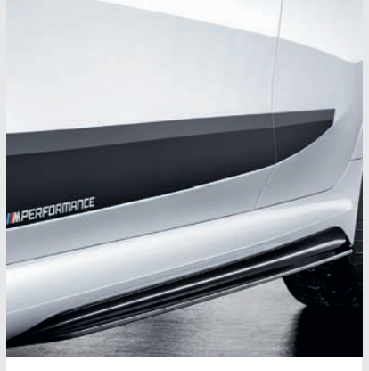
BMW M Performance Side Skirt Attachment in Black High-Gloss