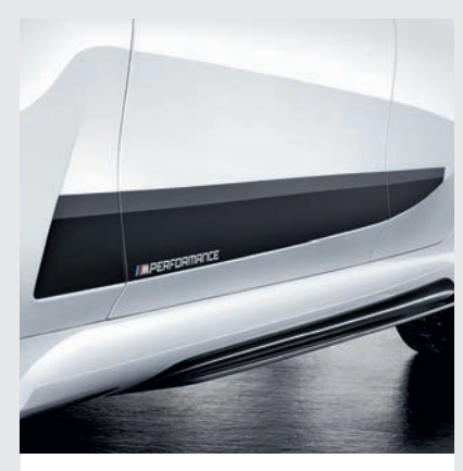
BMW M Performance Side Skirt Films in Frozen Black