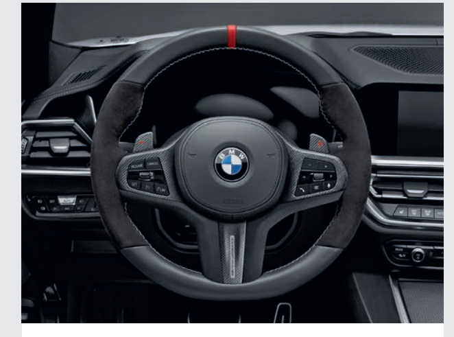
BMW M Performance Steering Wheel in Alcantara and Carbon Fibre