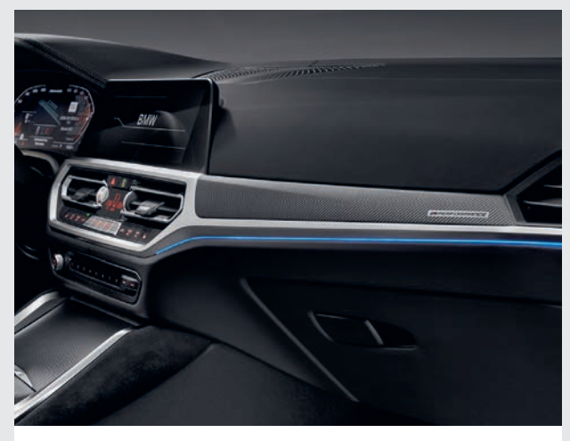
BMW M Performance Interior Trim in Carbon Fibre